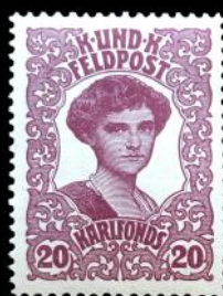
Mi AT-AH F74