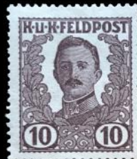
Mi AT-AH F V