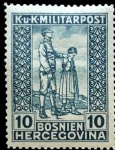
Mi AT-BA 142