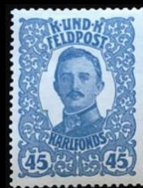
Mi AT-AH F75