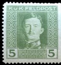
Mi AT-AH F56A