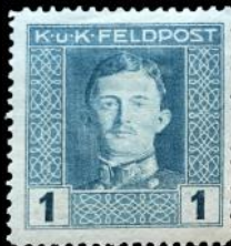
Mi AT-AH F53A

Only a partial group is shown, there are twenty separate stamps in the series ranging from 1 heller to 10 krone (Mi AT-AH F53A through F72A).