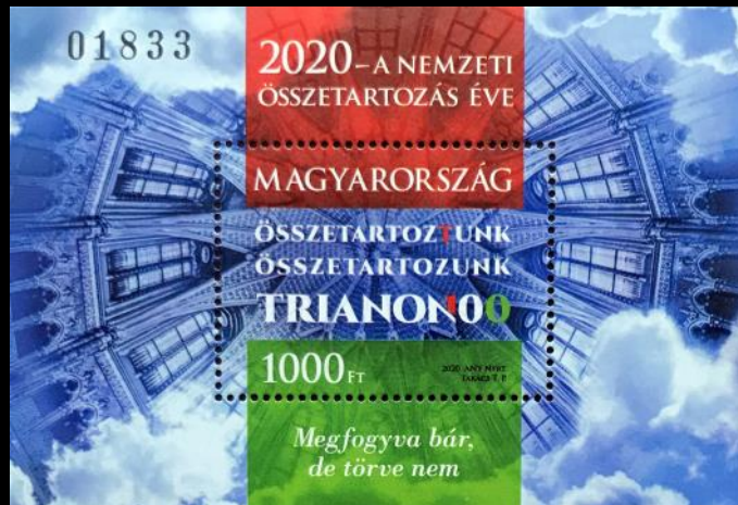
MI HU BL443A