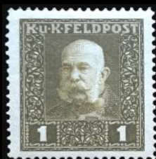
Mi AT-AH F22A

Only a partial group is shown, there are twenty-seven separate stamps in the series ranging from 1 heller to 10 krone.