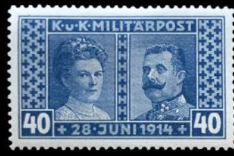
Mi AT-BA 123