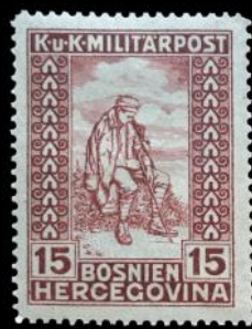
Mi AT-BA 143