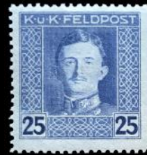
Mi AT-AH F62A