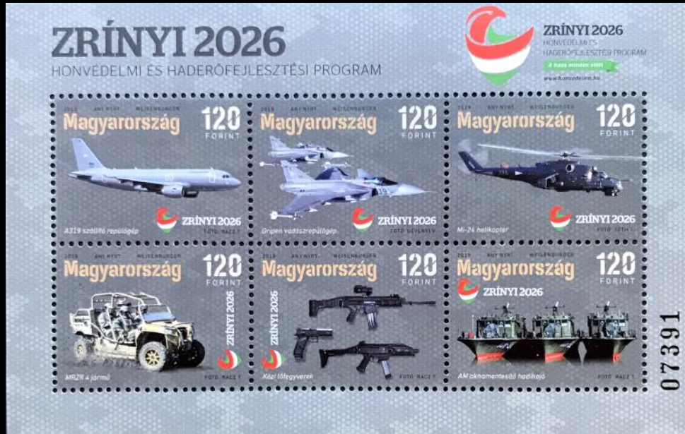
MI HU BL426