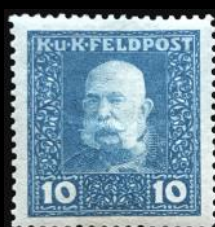
Mi AT-AH F28A