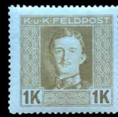
Mi AT-AH F XIV