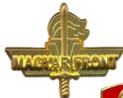
Magyar Front and membership lapel pins $5.00