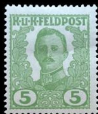
Mi AT-AH F IV

This series was never formally issued, but consists of 14 stamps ranging from 1 heller to 1 krone (Michel AT-AH FI through FXIV), only a partial group is shown.