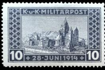
Mi AT-BA 121