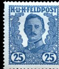
Mi AT-AH F VII