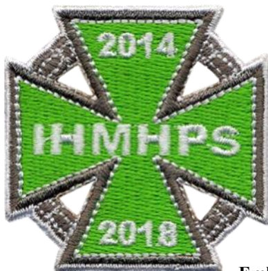
Embroidered insignia $5.00