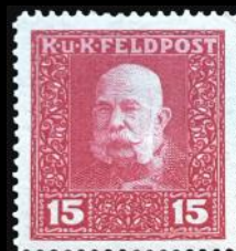
Mi AT-AH F30A