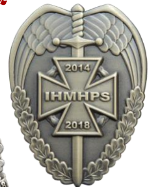
2014-2018 Badge $25.00