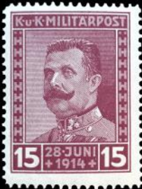
Mi AT-BA 122