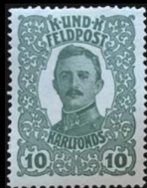
Mi AT-AH F73