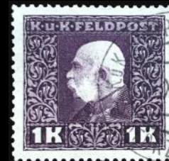
Mi AT-AH F43A