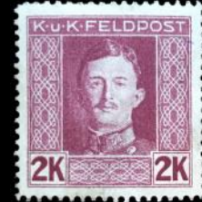
Mi AT-AH F69A